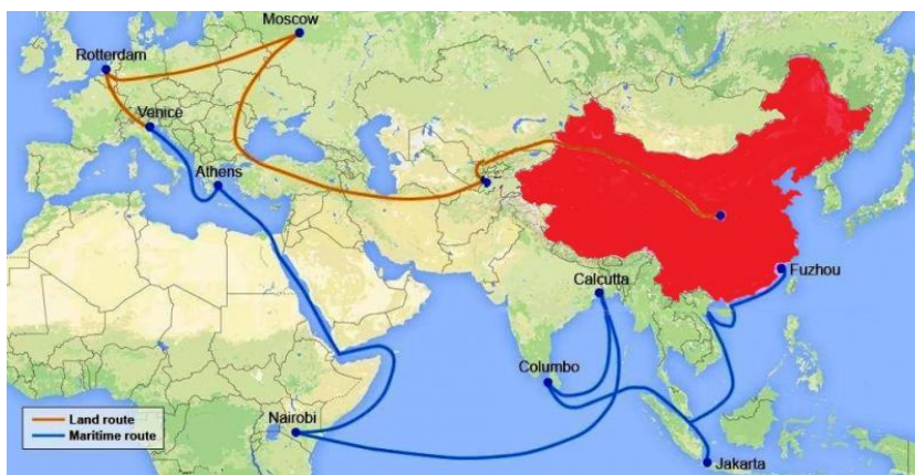
Figure 1. The 21st-Century Maritime Silk Road.

According to the action plan, the Belt and the Road will run through Asia, Europe, and Africa, connecting the East Asian economic sphere at one end with the European economies at the other. The Silk Road Economic Belt—a series of land-based infrastructure projects including roads, railways, and pipelines—focuses on strengthening links between China, Central Asia, Russia, and Europe (particularly the Baltic). China will gain improved access to the Persian Gulf and the Mediterranean Sea through Central Asia and West Asia, and to the Indian Ocean through Southeast Asia and South Asia. The 21st-Century Maritime Silk Road is designed as two paths: one from China's coast to Europe through the South China Sea and the Indian Ocean, and the other from China's coast through the South China Sea to the South Pacific region. 1