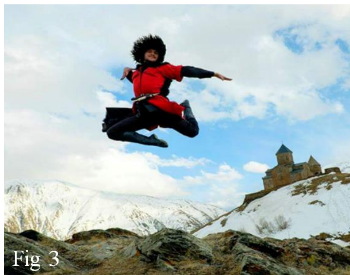
Fig. 3 Lezginka jumping figure after arthroscopic PCL reconstruction.