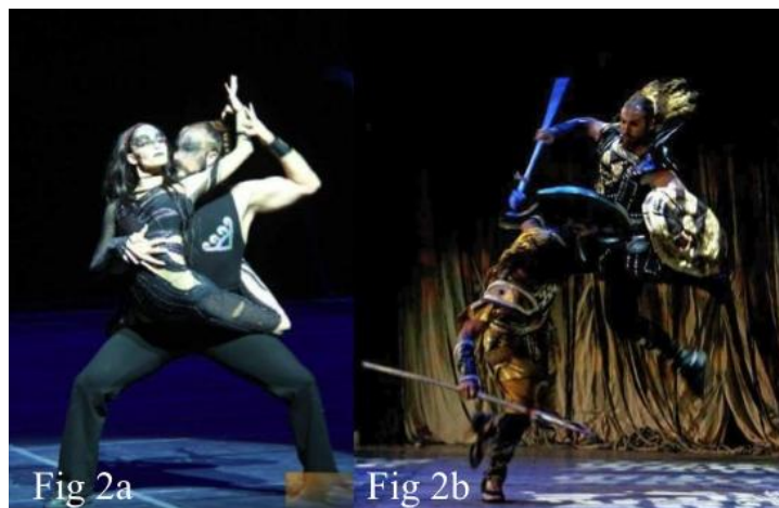
Fig. 2 Modern ballet dancer after meniscus repair is (a) squatting and (b) jumping under stress loading.

Another patient who had to undergo ACL reconstruction and open posterolateral corner (PLC) injury repair due to ACL/PLC injury could perform live 52 weeks later. In Fig. 4, post-operative dancing