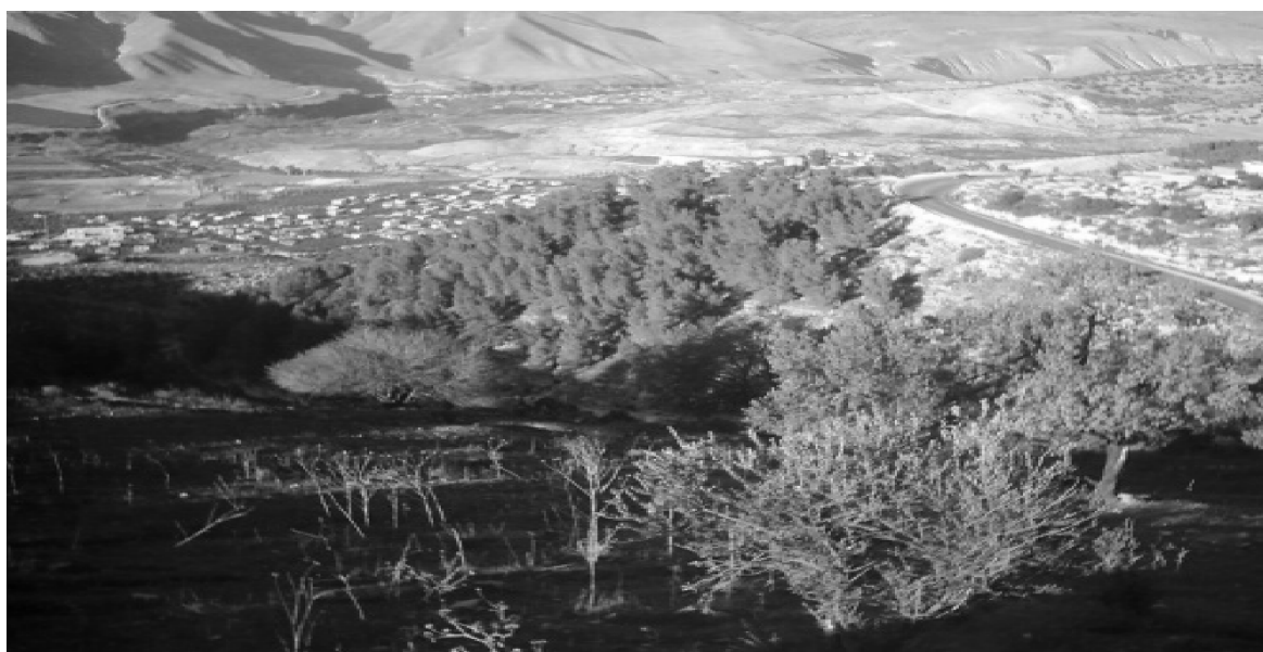
Fig. 3 Closer view of the hot spring (Al-Hemma).

The Byzantine part of the city is dominant from the octagonal church at the side of the Cardo Street which is astonishing in its style and the dark basalt stone. What does it mean by presenting the significant and distinctive parts of the city are the emphasis of their original potential values from the historic point of view.